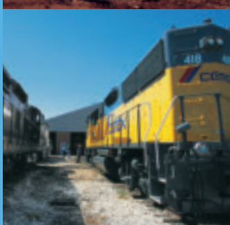
From top: Belle River Power Plant, Mich.; Custer Wellhead, Mich.; Renaissance Center on-site services, Detroit, Mich.; biomass site, Riverview, Mich.; rail services facility, Hastings, N.C.