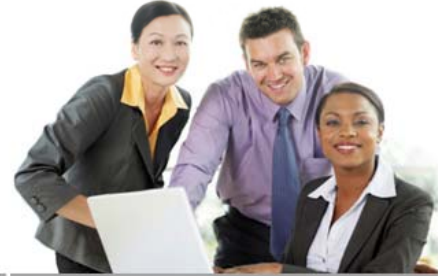
DTE Energy Company