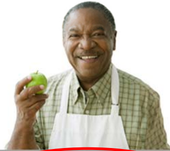
Business Utility Customers