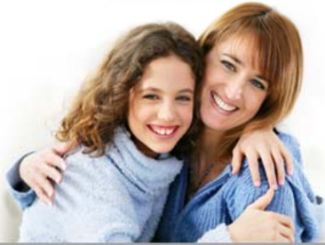
Residential Utility Customers