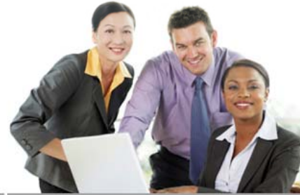
DTE Energy Company