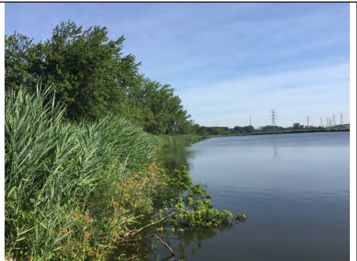
Photo 4: Looking north along west access road north of separation berm