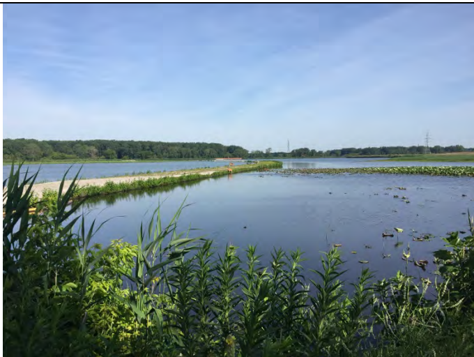
Photo 3: Looking west from east access road at south separation berm